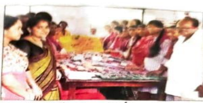
శిల్పం గిరిజా సంక్షేమ మహిళా ఆవాస డిగ్రీ కళాశాలలో పుస్తక ప్రదర్శన